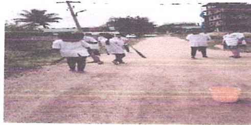
Students' active participation in Swachh Bharat

Geethanjali College of Pharmacy-NSS Units conducted a Swachh Bharat in Keesara Village at 02.30PM on 25/11/2019. Students came forward to clean the village during the camp which included teaching staff. All the B. Pharmacy II year students actively participated and cleaned the roads of the Keesara village and our beloved principal sir also participated in the event and made the event grand success.