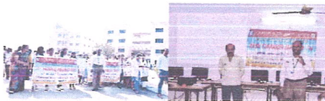
Rally for Awareness on Responsible use at medicine and Principal sir explaining school students the use of medicine

Geethanjali College of Pharmacy conducted a "Campaign for Awareness on Responsible Use at Medicine" in the occasion of 58 th National Pharmacy Week. At ZPHS Keesara and our college Pharm D II year students actively participated in the event, explained the school students about the proper use of different kind of medications and advantages of proper use of medications and our beloved principle also educated the school students regarding the proper usage of medicines. Firstly, a rally was conducted from our college to Keesara village. All the students of Pharm D II year and faculty members has been actively participated in the event and made the event grand success.