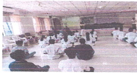
Students performing yoga guided by yoga trainer.

Geethanjali College of Pharmacy-NSS Units conducted meditation and yoga session in our college seminar hall block I at 11.30AM on 21/06/2021. Students came forward to meditate and yoga which included teaching staff. All the Pharm D I year students actively performed yoga and meditation and our beloved principal sir also participated in the event and educated the students about importance of yoga and meditation in day-to-day life and session ended in peace and calm.