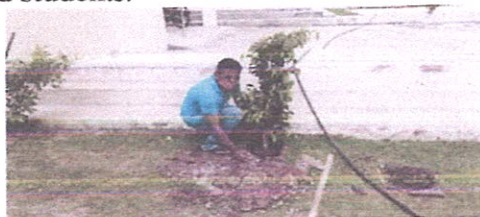
Tree plantation at GCP herbal garden

Tree Plantation programme was held in our college premises on 22/08/2019 at 02:30 PM. Students actively participated in the programme. Principal, Dept HOD's, faculty, and NSS Volunteers planted saplings in our college premises. Our faculty had also explained about the trees and the importance of tree plantation to students. At the end of programme there was a photo session with Principal, faculty and students.