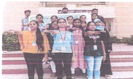
Students taking unity pledge.

Geethanjali College of Pharmacy-NSS Unit conducted Rastriya Ekta Diwas in Geethanjali College of Pharmacy seminar hall block-I, on 21/10/2019. Students of B. Pharmacy I year actively participated in the event, faculty and principal sir also participated in the event. All the assembled students and faculty members took the pledge of unity. Our beloved principle spoke about spreading the unity among the people and importance of it and the event was grand success.